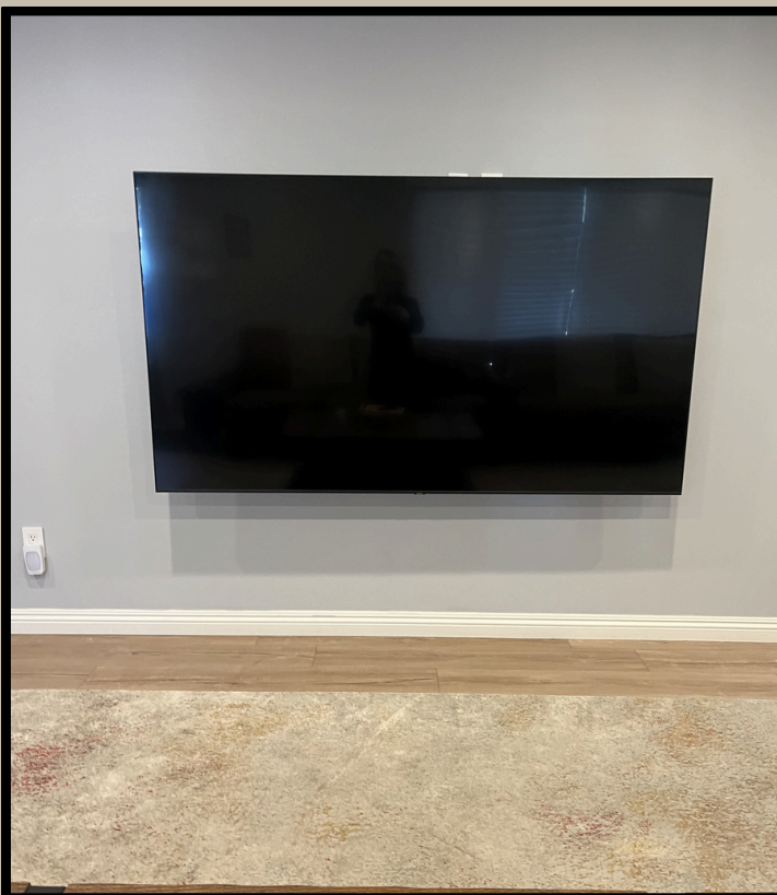
Plain 85" TV wall ; no storage or design.