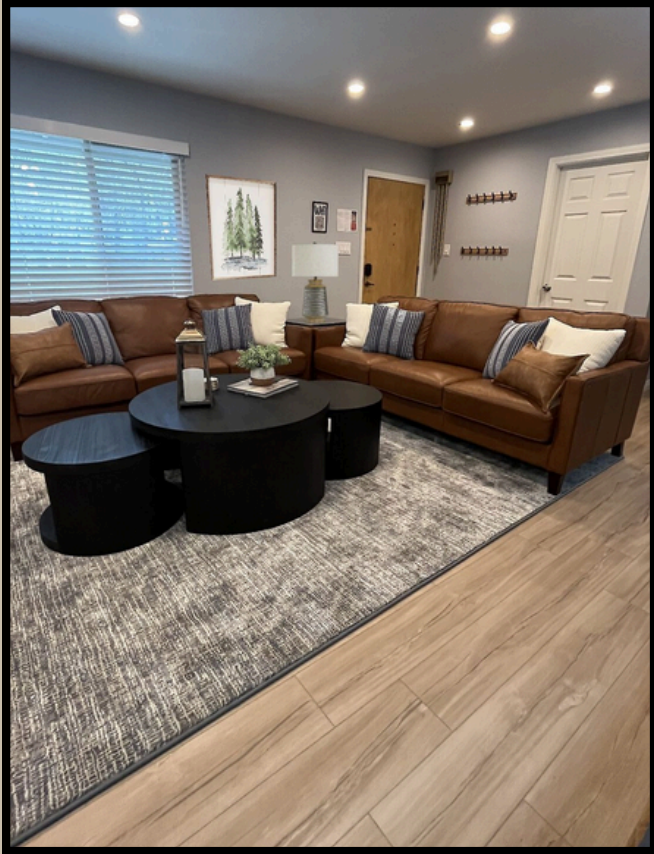
Utilized existing sofas, space enhanced with beautiful coffee tables and accessories, custom area rug.