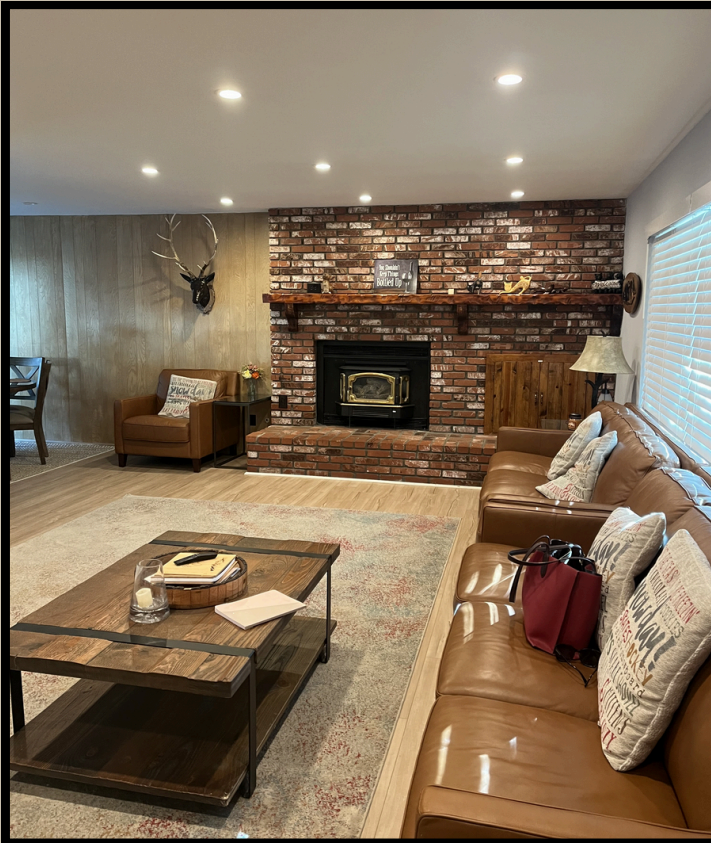
Old, dated furnishings, poor use of furniture placement.