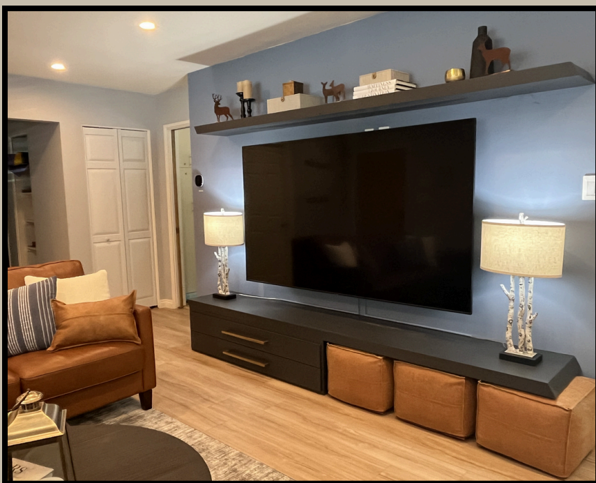
Custom TV cabinet storing leather poufs for extra guest seating, accent blue wall.