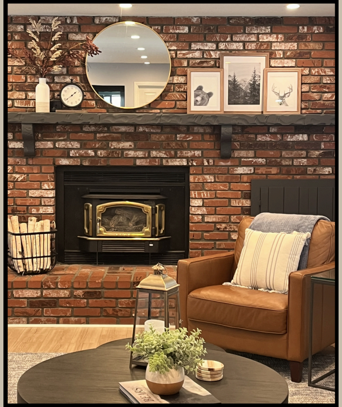
Mantel and cabinet door refreshed with black paint, fireplace styled with updated furnishings, utilized existing chair.