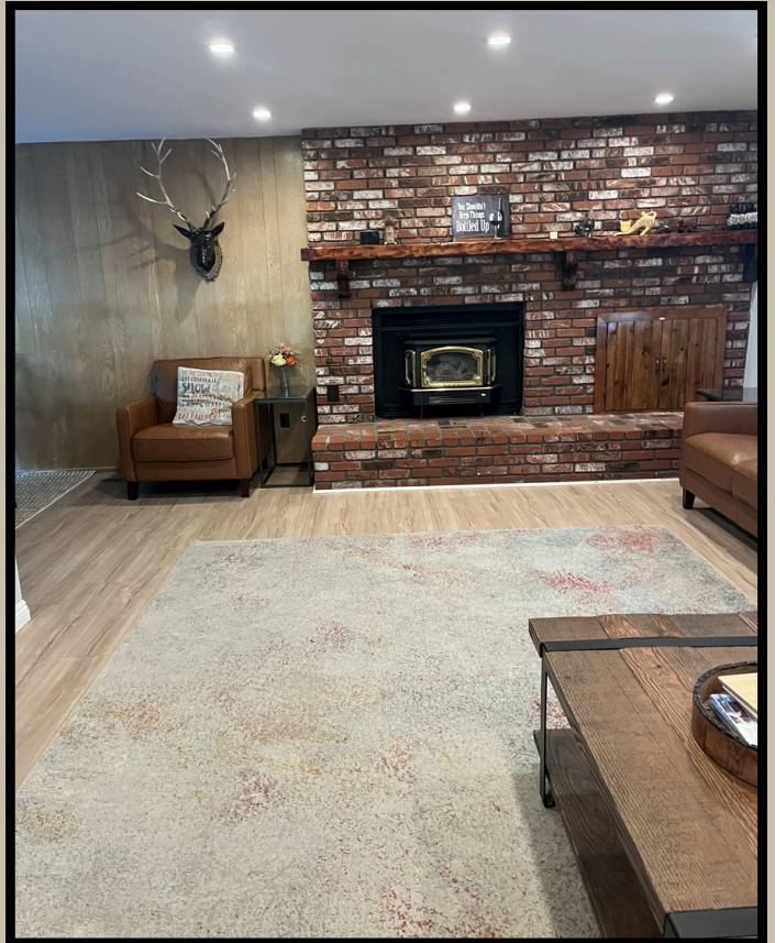
Tired area rug, uninviting fireplace, old, dated wall paneling.