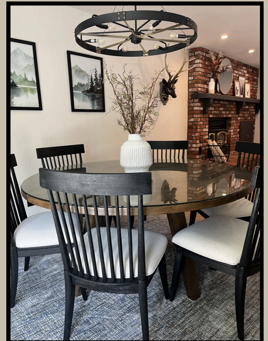
New chandelier, dining room chairs, area rug and painted dated paneling.