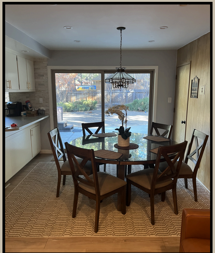
Dated dining room furniture, area rug and chandelier.